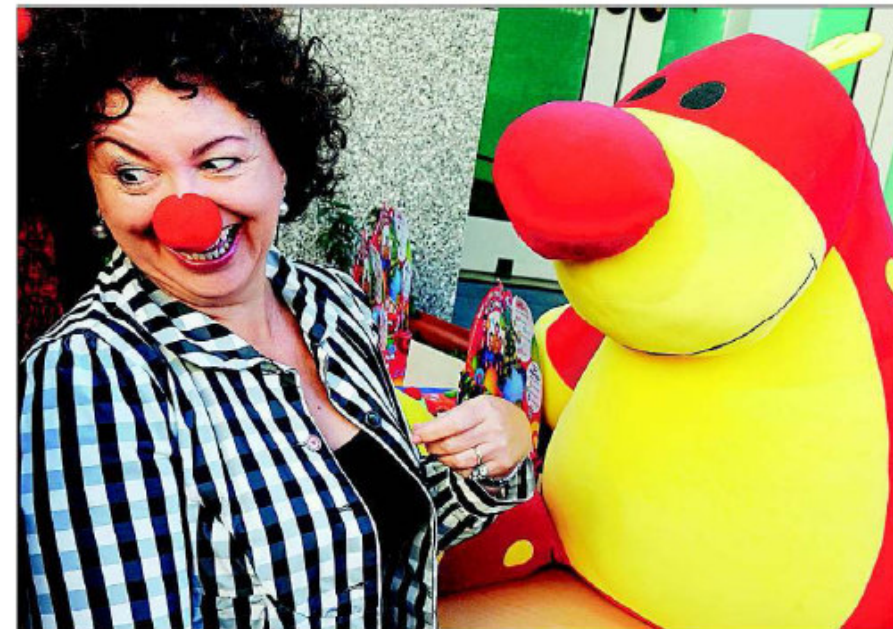
THE NOSE HAVE IT: Therese Rein gets into the swing of fund-raising for Red Nose Day, launching a Pregnancy, Birthing and Babies helpline at Parliament House.

"All of these questions can be either answered by the helpline or a person can be referred through to another specialised service," she said.