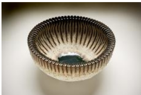
SIDS and Kids ACT's Journeys — An Exhibition of Works by Bereaved Parents , will include photography, jewellery and ceramics.

The exhibition will showcase a range of different artworks portraying the artists' journeys through the use of ceramics, jewellery, painting and