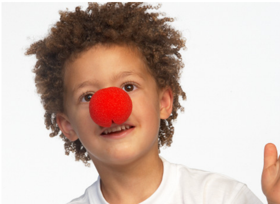
Your child could be this year's face of Red Nose Day in NSW? Find out at alex&marc in Castle Towers.

From our telephone parent supporters, to those who help out in our offices and the hundreds of volunteers who hit the streets on Red Nose Day we simply couldn't do it without you.