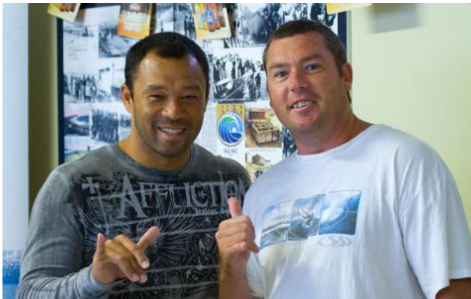
Celebrity surfer sunny Garcia dropped into the inaugural Hunter Business Boardrider's Breakfast in March to raise funds for SIDS and Kids Hunter Region and SurfAid International.