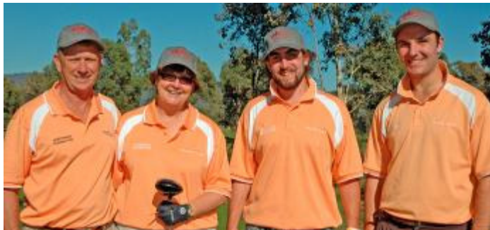
The Handyman's Trading Post team enjoyed the fantastic weather for this year's ProStyle SIDS and Kids ACT golf day.